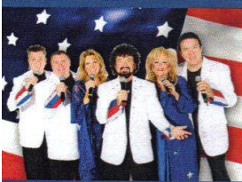
COUNTRY JAMBOREE BREAKFAST VARIETY SHOW